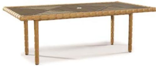
9506-84 RECTANGULAR DINING TABLE W 85" D 45" H 30" MSRP $ 3597