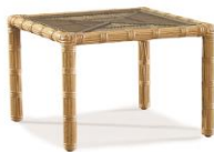
9506-22 END TABLE W 24" D 24" H 20" MSRP $ 747