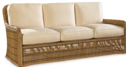
506-03 SOFA W 82" D 37" H 35" MSRP $ 4197