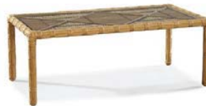
9506-23 COCKTAIL TABLE W 49" D 25" H 18" MSRP $1197

Contact: Blanca Williams Heritage Home Group 828-759-8568 Blanca.williams@heritagehome.com