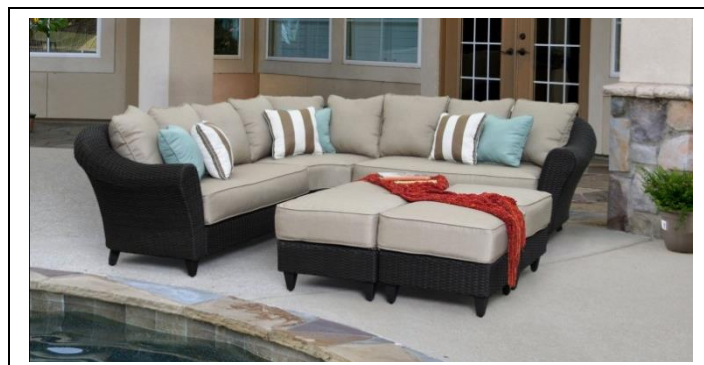
LA JOYA COLLECTION