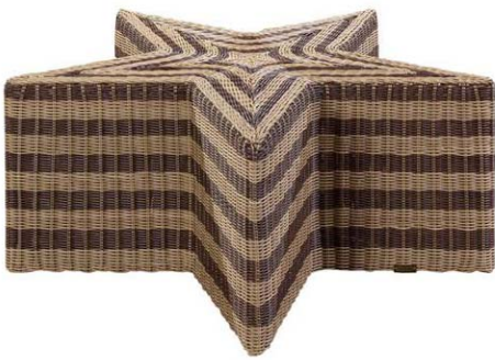
9508-05 STAR COCKTAIL W43 D41 H17