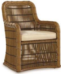
506-79 DINING ARM CHAIR W 26 D 28 H 36 MSRP $ 1347