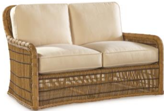
506-02 LOVESEAT W 56" D 37" H 35" MSRP $3570