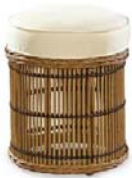
506-09 POUF OTTOMAN W 14" D 14" H 18" MSRP $ 747